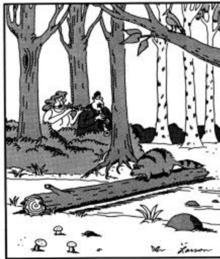
On this particular day, Rory the raccoon was hunting frogs at his favorite stream, and the pleasant background music told him that Mr. Mountain Lion was nowhere around.